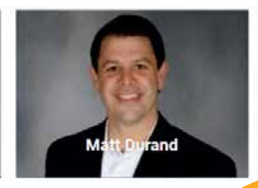
Community Champions, working together for a Brighter Future for Everyone!!